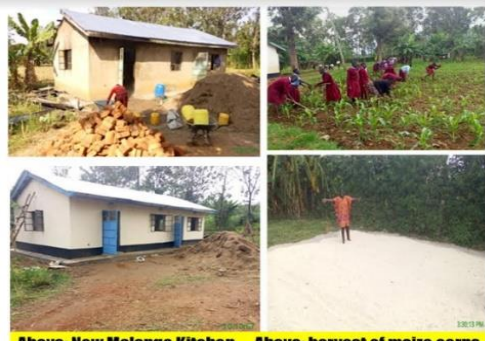
Above: New Malanga Kitchen Above: harvest of maize cobs THANK YOU ST ANNE'S CHURCH ACADEMY Below: excited pupils receiving their pen pal letters